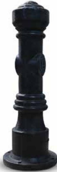
Cast Iron Barrier (DUBA)